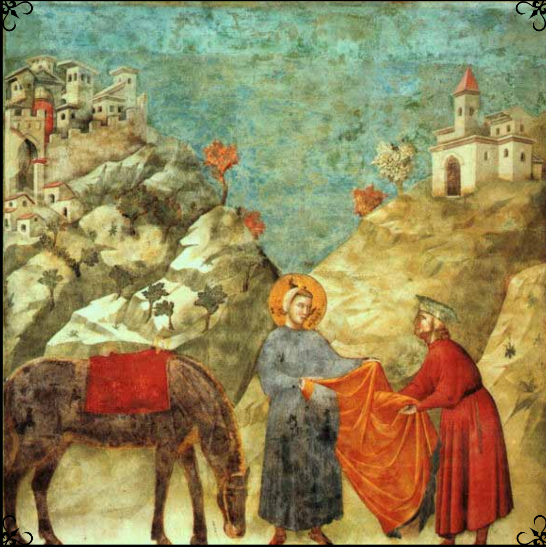
Saint Francis Giving his Mantle to a Poor Man, before 1300, fresco, Upper Church of San Francesco at Assisi